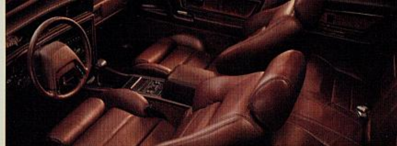
1987 Lincoln Mark VII LSC in Cabernet Clearcoat Metallic with Cabernet leather interior. Some features shown may be optional. See your Lincoln-Mercury dealer for details.

For driving pleasure and performance, 1987 Lincoln Mark VII.